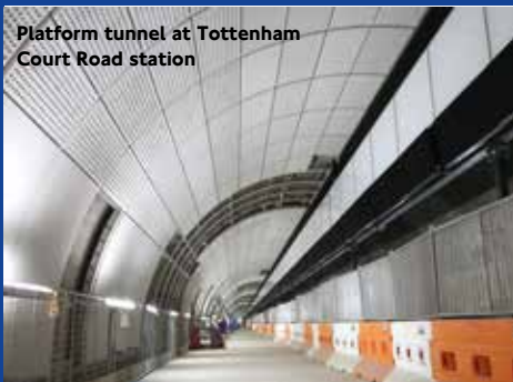
Platform tunnel at Tottenham Court Road station

The Pensioners' Representatives noted that the work on the section of the Elizabeth line from Brentwood to Shenfield was now complete. Additionally, the first trains between Liverpool Street and Shenfield would be introduced on the line from the end of May. It was agreed that information regarding restrictions for PTAC holders on National Rail services and County Bus services would be incorporated into a future edition of otm .