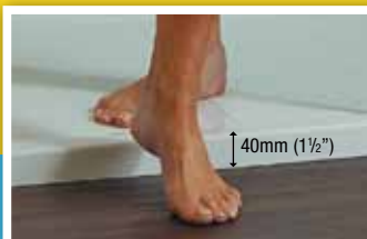
Easy-access entry – just 1 1/2" high

For a free copy of our 44 page brochure CALL FREE now on