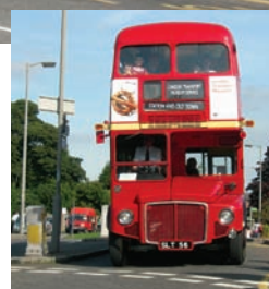
RM1 was on hand to carry passengers between Amersham station and heritage events in the town.

"There were a lot of families travelling, so it's nice to think the event might have encouraged a new generation to develop an interest in our transport heritage."