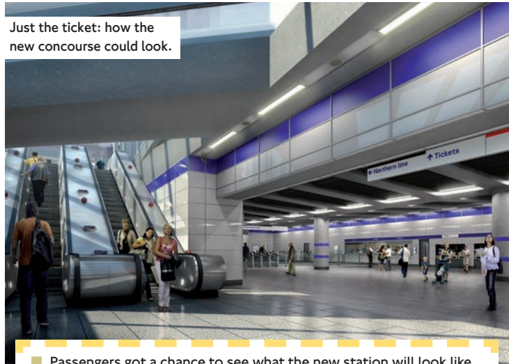
Just the ticket: how the new concourse could look.

Five new lifts will provide step-free access for the first time and more escalators will be installed.