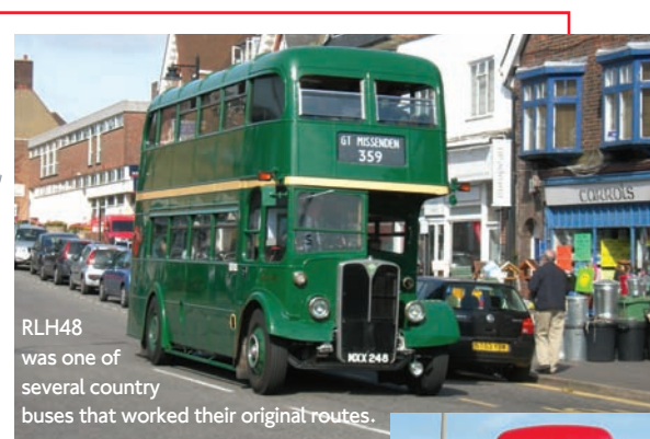
RLH48 was one of several country buses that worked their original routes.

• a new exhibition at the London Transport Museum – Design for Travel – explores the evolution of the logo. For more information, visit www.ltmuseum.co.uk