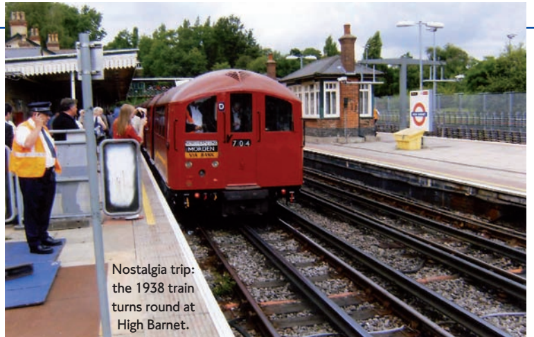
Nostalgia trip: the 1938 train turns round at High Barnet.

Most of the stock was then scrapped, but there is still some in service on the Ryde line on the Isle of Wight.