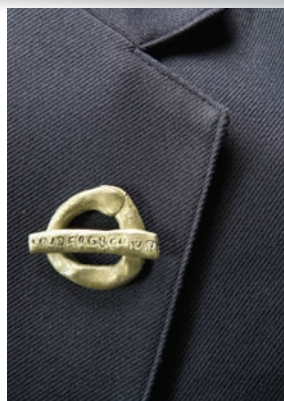
Artwork by Des Hughes.