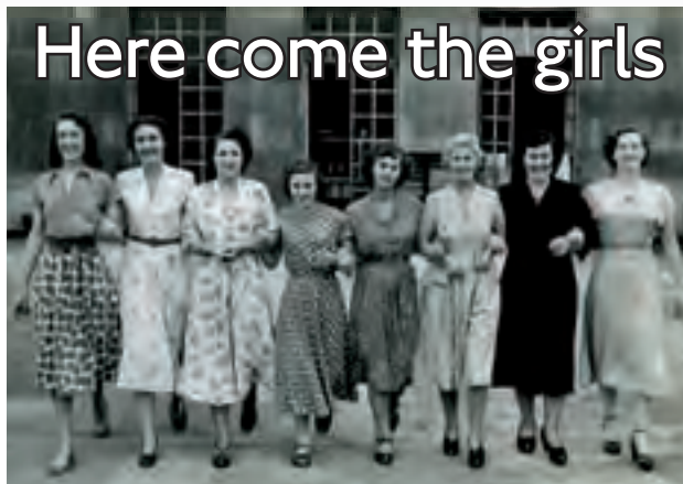
Stepping out: the enquiries team poses for a photo.

went to St James's Park to see the inauguration of Queen Elizabeth II and we watched the rehearsals for the coronation.