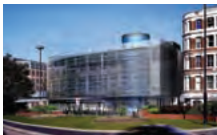
Better Blackfriars: the station will be transformed.

Once the Thameslink transformation is complete, the number of through trains per hour will increase from eight to up to 24, running to new destinations such as Cambridge.