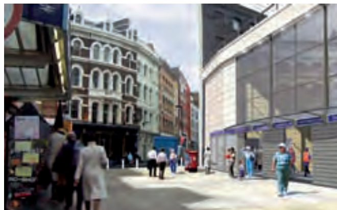
Future Farringdon: how the station exterior will look.