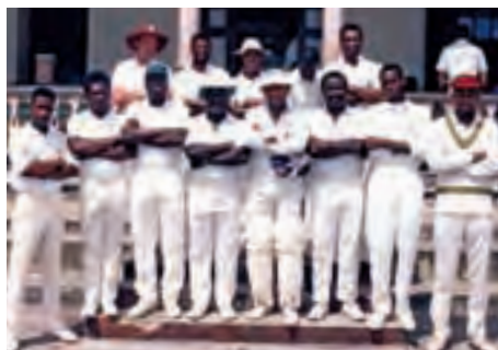
Howzat: the cricket team on tour in 1995.

"It was an amazing time to be at 55 Broadway. We all