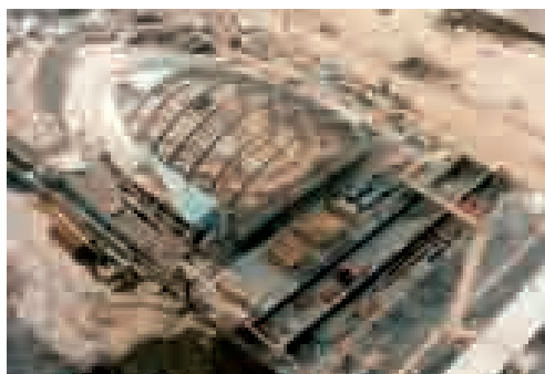
Canary construction: Canary Wharf station being built in 1998.