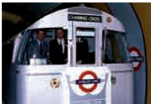
By royal appointment: Prince Charles rides in the first Jubilee line cab at Green Park on the launch day on 30 April 1979.