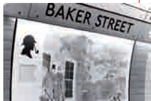
Platform scene: Sherlock Holmes' short story Charles Augustus Milverton on display at the Jubilee line platform at Baker Street.