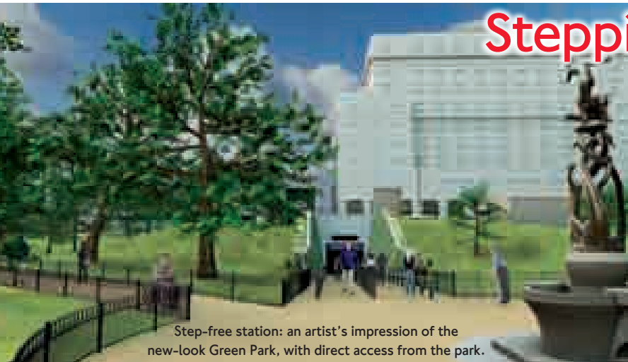
Step-free station: an artist's impression of the new-look Green Park, with direct access from the park.

The lifts are due for completion in 2011. Other upgrades include contrasting handrails and tactile flooring on platforms to benefit partially sighted customers.