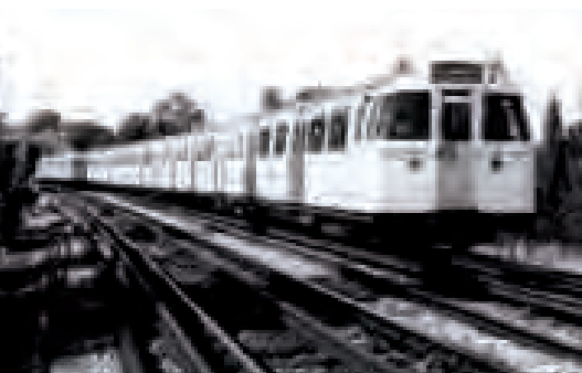
On line: 1972 Tube stock en route to Charing Cross in 1980.

Here, we round up some photos from around the line over the last three decades.