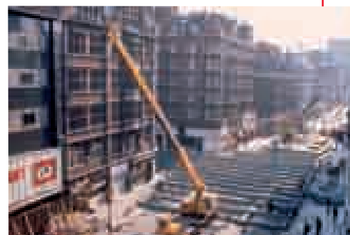
Ground work: construction work for the line along Oxford Street in June 1972.