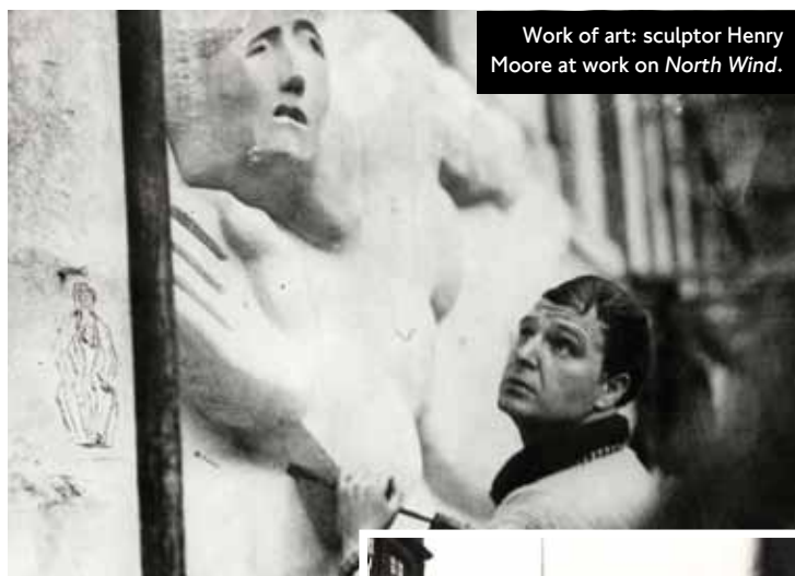
Work of art: sculptor Henry Moore at work on North Wind .

The building was originally granted Grade II status in 1970.