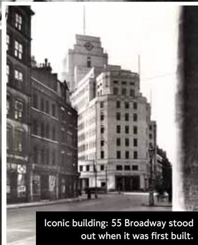
Iconic building: 55 Broadway stood out when it was first built.