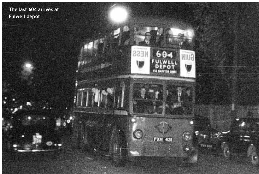
The last 604 arrives at Fulwell depot

never have been abandoned: "It was ecologically sound, clean, quiet and efficient which should have borne more weight than the relatively cheap diesel fuel at the time for motor buses. However, we did not think like that then."