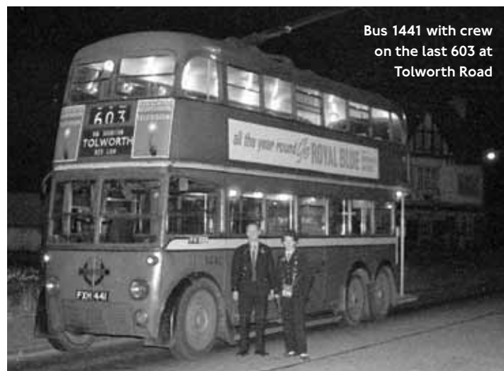
Bus 1441 with crew on the last 603 at Tolworth Road