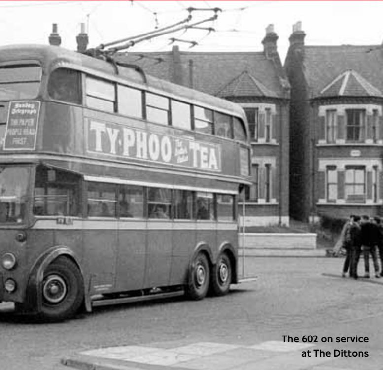
The 602 on service at The Dittons