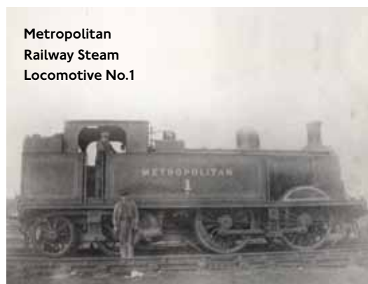
Metropolitan Railway Steam Locomotive No.1