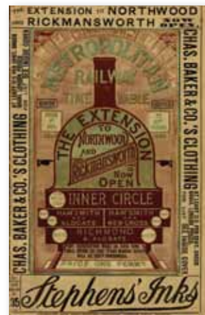
Metropolitan Railway timetable and map, 1888 (right) and below, Metropolitan Railway, third class single, 13 April 1868

Contact curator@amershammuseum.org , 01494 723700 or visit www.amershammuseum.org .