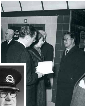
presented to the Queen at the opening of the Victoria line.