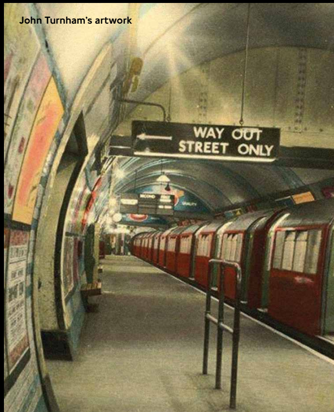
John Turnham's artwork

The new bus for London is inspired by the old Routemaster